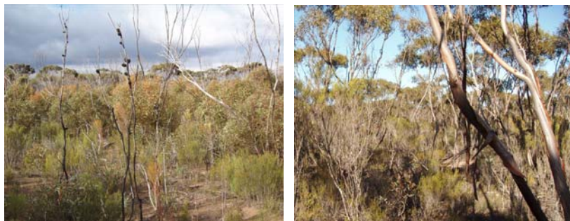
A recently burnt (left: 6 years post-fire) and long unburnt (right: >40 years post-fire) example of the mallee (above) and mallee-heath (below) vegetation communities