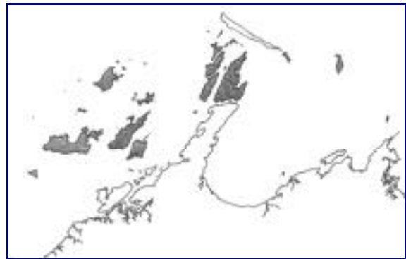
Dampier Archipelago nature reserves and recreation reserves managed by CALM